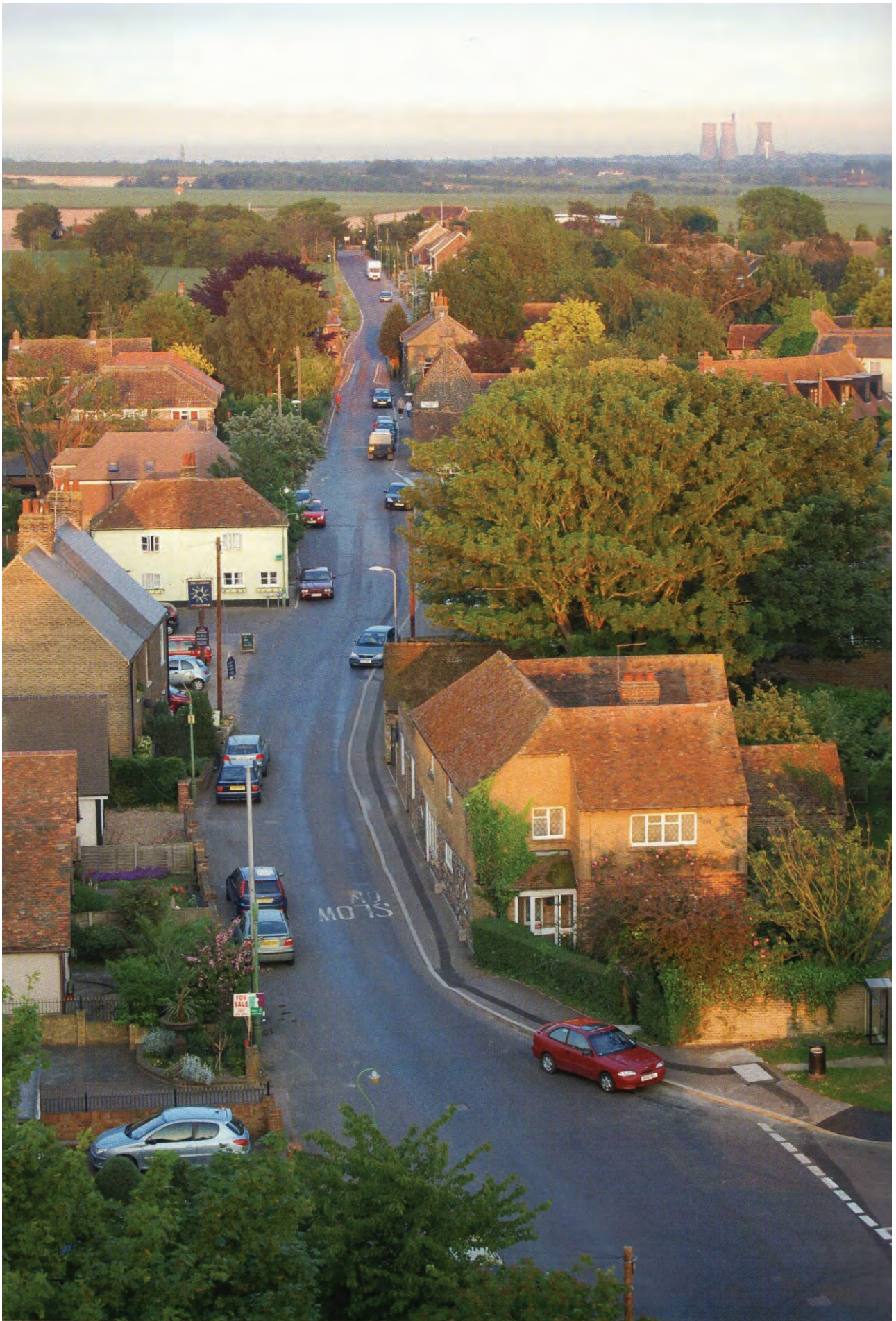
St Nicholas village – view from the church tower